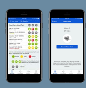
Monitor and check asset health